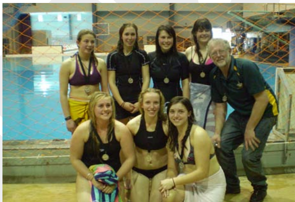
2nd Senior Girls: Rangiora High School