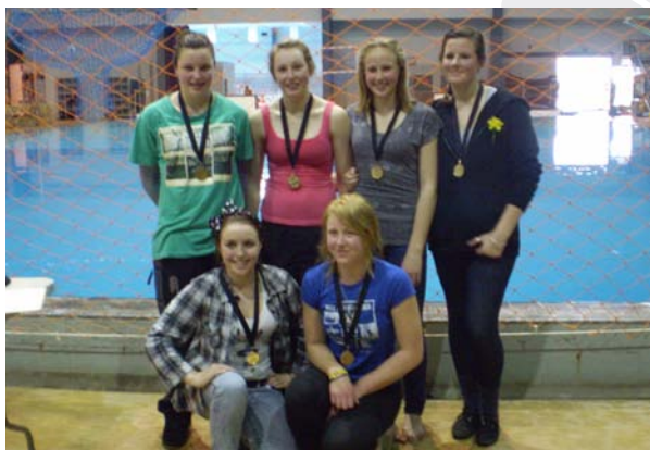
1st Senior Girls: Mt Aspiring College