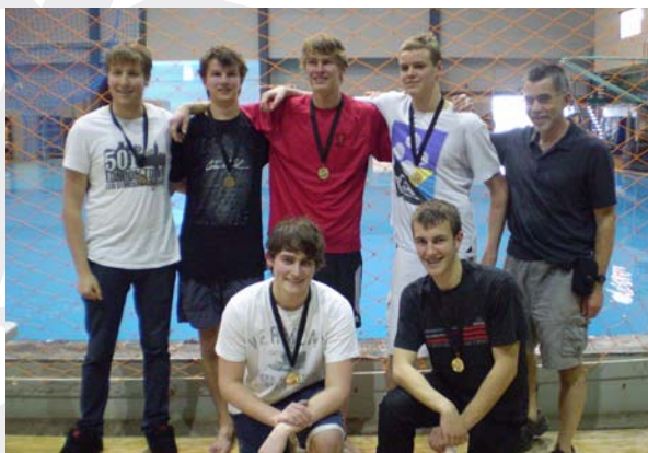
1st Open: Middleton High School