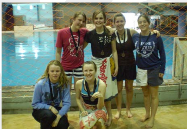
3rd Senior Girls: Middleton High School