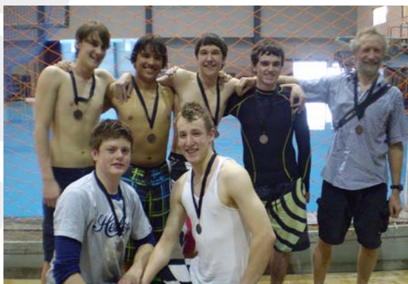
3rd Open: Shirley Boys' High School