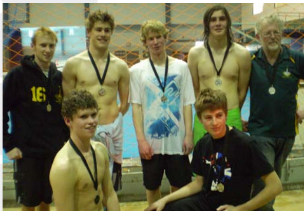
2nd Open: Rangiora High School